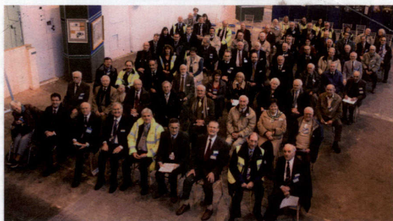
Old-timers gather in BEPO's hanger on the 40th anniversary of its shutdown to share recollections with the decommissioning team.

One of Price's main occupations had been to measure the neutron capture cross-sections of three isotopes of crucial interest to the bomb-makers: ^{235}\text{U} , ^{239}\text{Pu} and ^{241}\text{Pu} . For ^{241}\text{Pu} there was no published information avail-