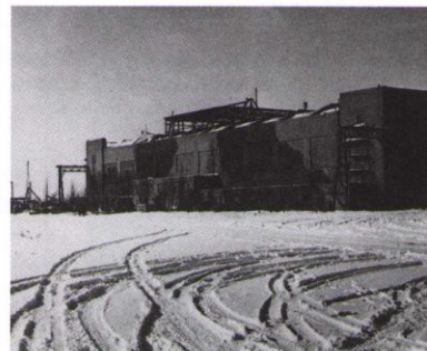
Hangar 10 in the snows of Winter 1947. The recently raised roof to accommodate the BEPO reactor can be seen.