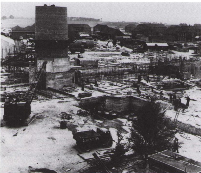
Work starts on the BEPO Chimney stack in the severe winter of 1947. The architect wanted an eight-sided stack but a circular one was built for expediency. Surrounding it is the maze of ducts and trenches.

Harwell site occurring through a fall from the top. The tower was demolished in 1962.