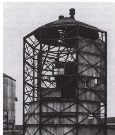
One of the three navigational training towers, known as 'The Harwell Box' used by the RAF for aircraft training to simulate engine failures, enemy aircraft attack and celestial navigation. The gunner had to follow the movement of a spot of light with another light which was fixed to the gun mounting in his turret. It was in a fall from the top of one of these towers that the first Harwell fatality occurred.